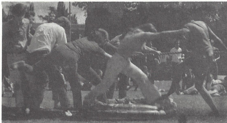
Student Council and the school faculty show their strength at last Thursday's tug-of-war on the Senior Lawn. The festivities highlighted spirit week, October 4-8.

The next meeting of the PTA will be held Wednesday, October 27 at 7:30 p.m. in Odins Hall, and will be devoted to the election of officers.